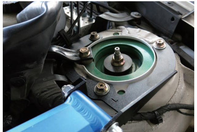
Illustration of installed state 完成示意圖