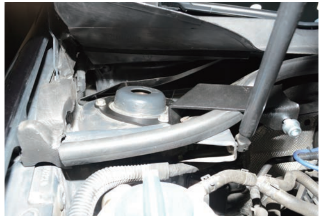
Illustration of installed state 完成示意圖